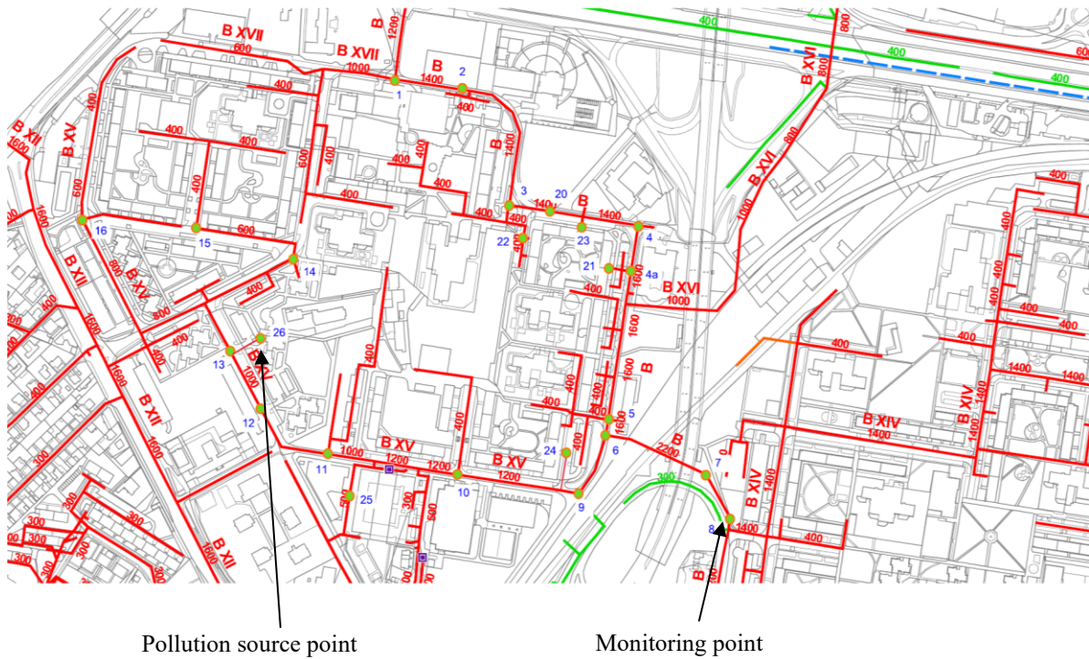
Fig. 1. Hydraulic scheme of the sewer network

The designed method for identification of the unknown pollution sources in sewer systems / inverse task solution was calibrated using results of experiments on real sewer network in the city part Bratislava - Petržalka (Slovak republic). For the tests we used part of the sewer network with 247 manholes. The sewer structure of this test area has two main sewer branches with the signature B and BXV. The monitoring point was located approximately 200 meters downstream of the confluence of these two branches, (see the Figure 1).