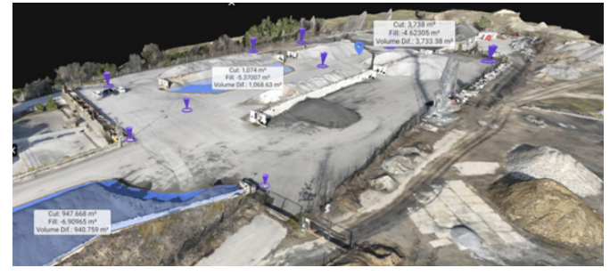
Fig. 1. Tested stockpiles Rys. 1. Badane zwałowiska