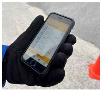
Fig. 6. iPhone SE – installed application Rys. 6. Aplikacja w telefonie IPhone SE