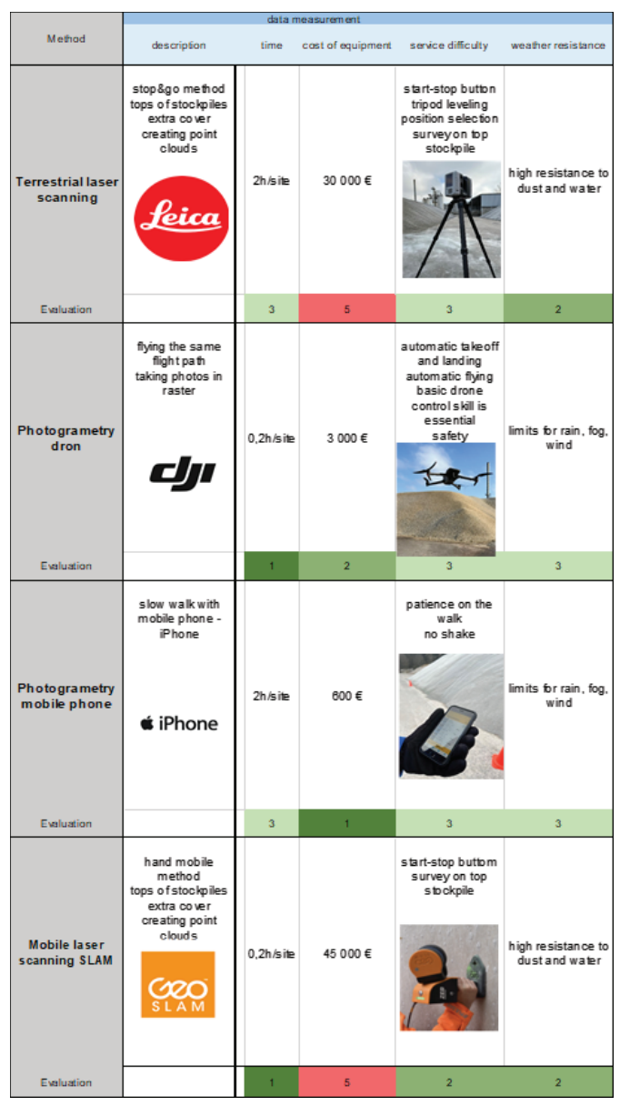
Fig. 7. Comparison of individual methods Rys. 7. Porównanie stosowanych metod

• iPhone SE – application Stockpile report for volume calculation