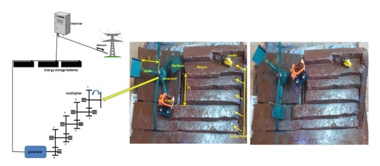
Fig. 2. New system of gravitricity Rys. 2. Nowy system odzysku energii