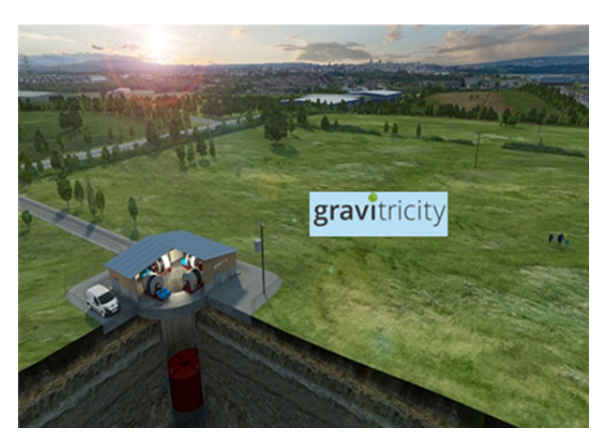
Fig.1. Gravitricity in shaft mine Rys. 1. Odzysk energii w szybie kopalni

are built according to the rotation of blade, so all of them form an arc. The batteries of energy storage is put in order to avoid the cut of electricity in the case where the blade stops for the embarkation or the descent of the truck from platform of system. Also an electricity regulation inverter is installed before dedicating electrical energy to the users.